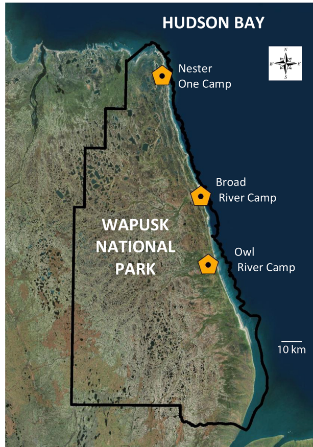
Fig. 1. Map of the Greater Wapusk Ecosystem with base map derived from LANDSAT imagery (Map data: Google, DigitalGlobe, 2018) showing camp locations and the Wapusk National Park boundary.

camps in the park, located at varying distances from the coast (Nester One = 2.3 km, Broad River = 4 km, Owl River = 6 km). Nester One is located on open tundra, whereas the Broad and Owl River camps are located on riverbanks at the interface between tundra and forest–tundra (Brook and Kenkel 2002). These camps all have hard-sided buildings surrounded by permanent 3 m high pagewire fences with rectangular perimeters approximately 22 m × 57 m. Access is by aircraft or snow machine only and the camps are largely used in winter, spring, and early summer by park staff, researchers, and university field courses. Potential bear attractants are tightly controlled and camp users' garbage is typically removed or burned on-site.