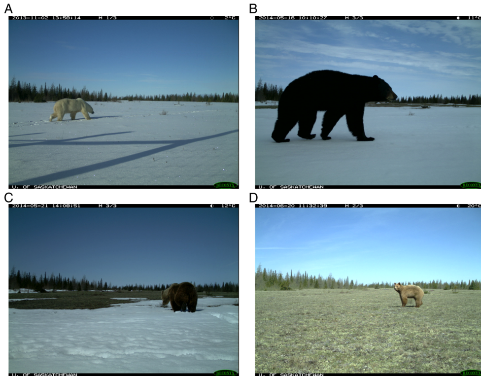
Fig. 3. (A) polar bear, (B) black-phase American black bear, (C) grizzly bear, and (D) cinnamon-phase American black bear at Owl River camp, Wapusk National Park.

non-aggressive interaction between those two individuals and the known timing of the black bear mating season (Tsubota et al. 1997).