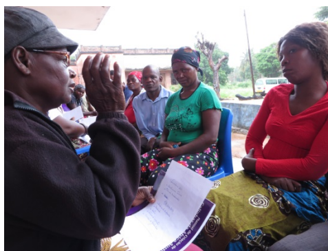
Community Conference, 2013